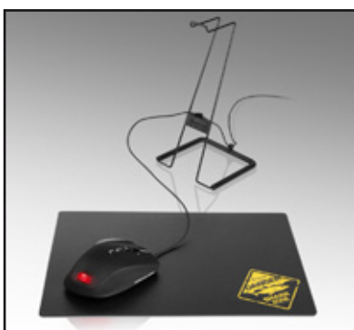
Including mouse cable guide