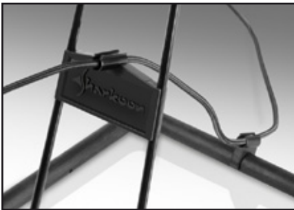
Safe and comfortable mouse cable guide

Headset stand with included mouse cable guide